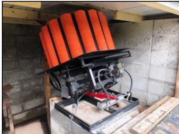
Our New PAT Trap Machine

Still looking for a volunteer to take over the Secretary Position—Contact the President if interested.